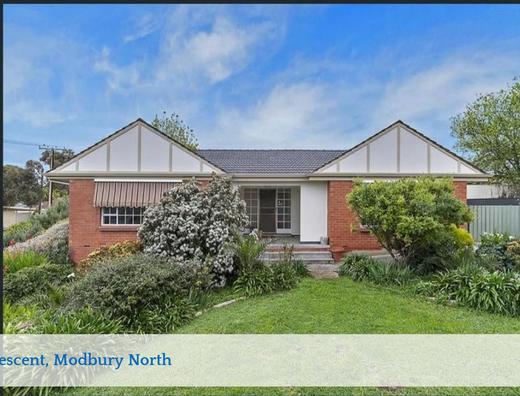
24 Hillary Crescent, Modbury North